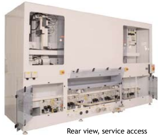
Rear view, service access