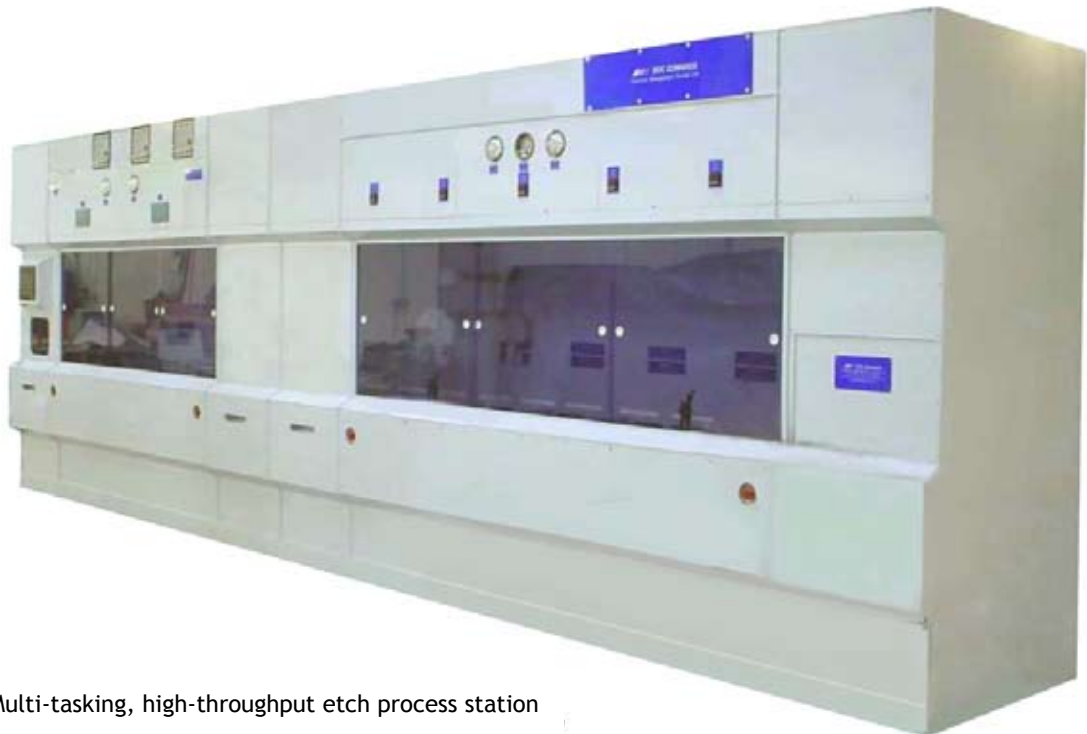
Multi-tasking, high-throughput etch process station

Your CME equipment installations are supported by engineers based in our Newhaven, UK facility. We will work with your site services team to bring your new wet process systems online. A wide range of start-up and maintenance services are available from CME, allowing you to concentrate on your core competencies.