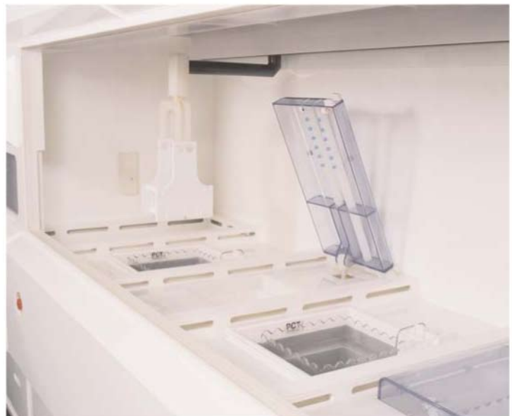
Wafer processing area