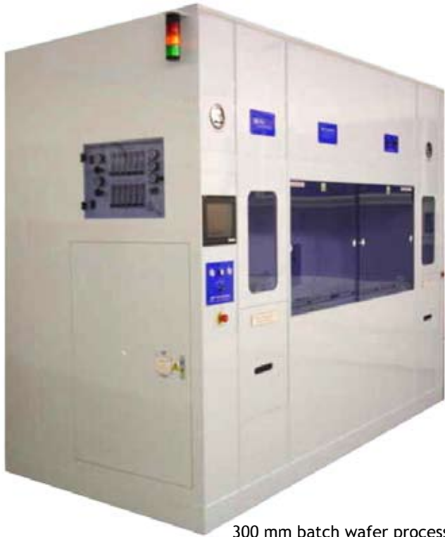
300 mm batch wafer processing

Cooperating with our customers and suppliers to provide innovative wet processing solutions, including specialized equipment and turnkey project support, to meet your wet process requirements.