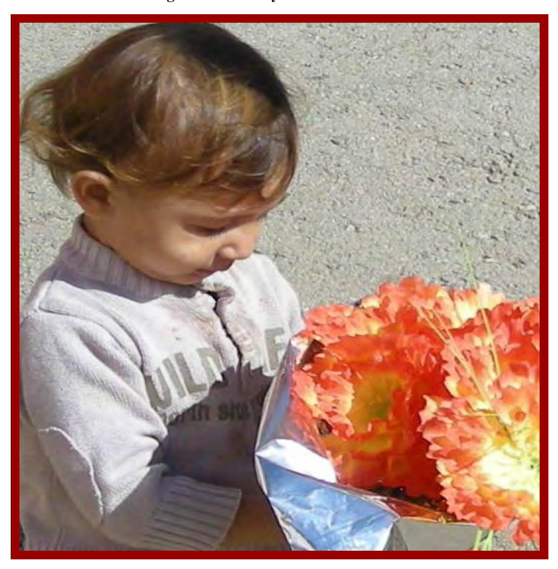
Say it with Flowers A 'Thank You' to Miracles from one of its Bosnian children