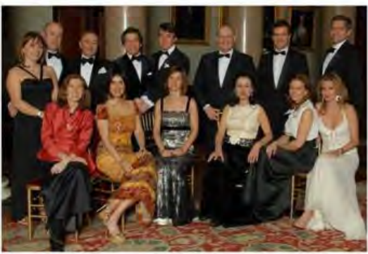
Miracles' Spanish Friends