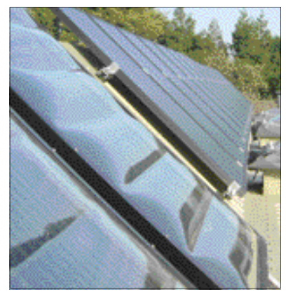
The Earthship Solar Panels

Earthships enjoy the weather, regardless of season. If it's raining they catch free water, if it's windy they generate free power and if it's sunny they are capturing free heat and electricity. They also employ extensive energy efficiency and water conservation measures, ensuring that the rainwater and renewable energy they harvest go as far as possible.