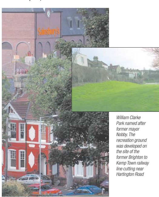
Reminders of the former Kemp Town railway remain. Sainsbury's store, built on the Vogue Gyratory and viewed from William Clarke Park, has an archway motif on the side